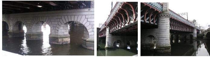
The piers and girders of the Central Railway Bridge.