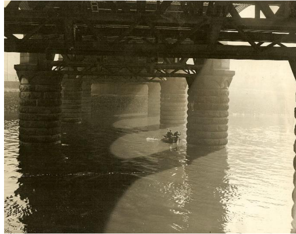
The actual search for the "egg man"

After some hours of search Father could not understand why he had not yet recovered the body, if the witness's story was correct, and he couldn't really get a better witness than the police officer.