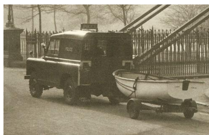
Landrover towing boat to an incident.