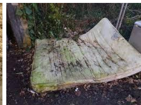
Mattress fom bridge

The amount of room that is among the girders of the Railway Bridge is seemingly amazing. Over the years it seems that many down and outs have lived among the girders of the bridge. I know that some of the good time girls took their clients up among the girders where they had mattresses. We discovered this one night when we were searching for a man who drowned off the Glasgow Bridge and witnessed one of the girls and a man coming down off the girders. Police checked and found mattresses and other items which were removed. As said amazing what goes on.